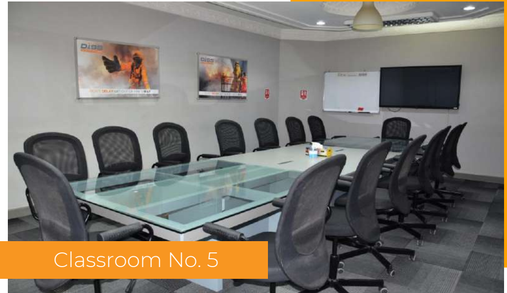
Classroom No. 5