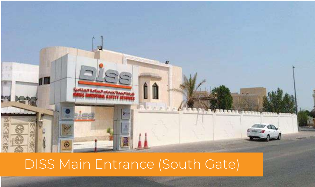
DISS Main Entrance (South Gate)