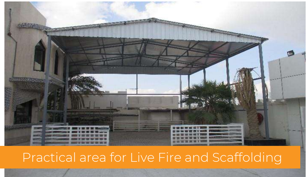
Practical area for Live Fire and Scaffolding