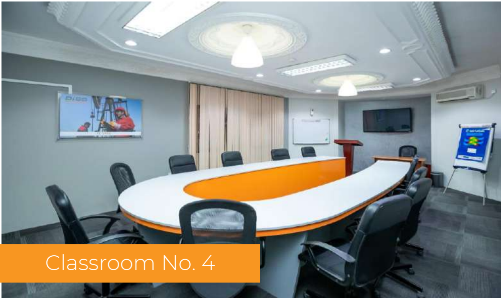
Classroom No. 4