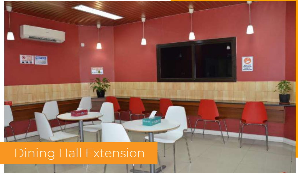
Dining Hall Extension