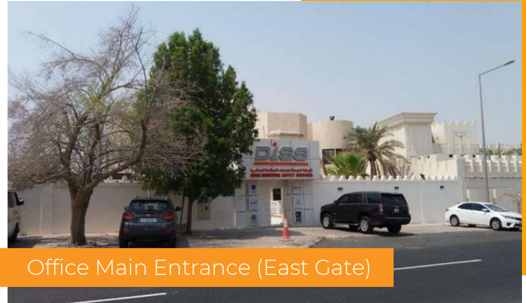
Office Main Entrance (East Gate)