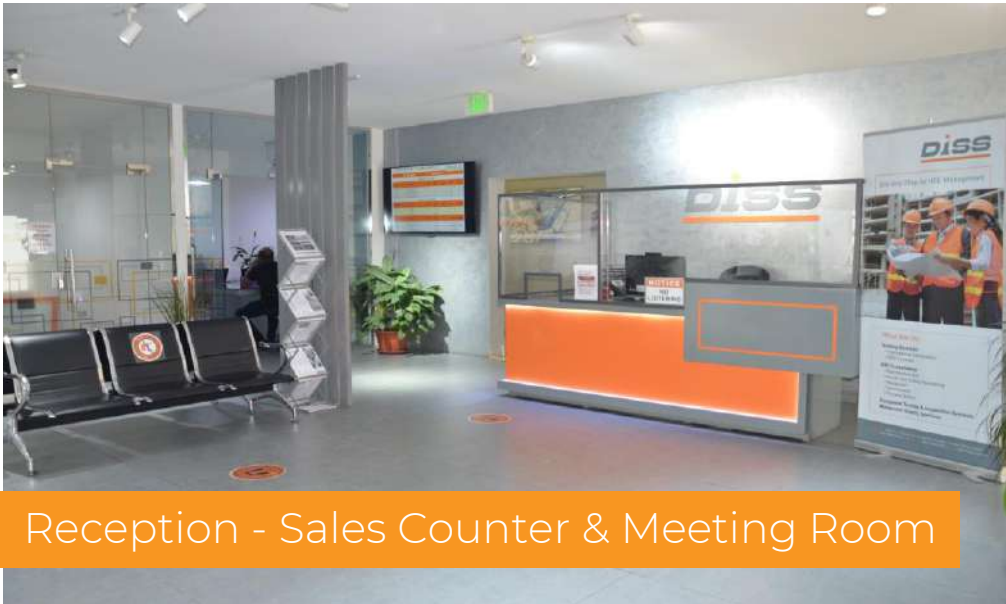
Reception - Sales Counter & Meeting Room