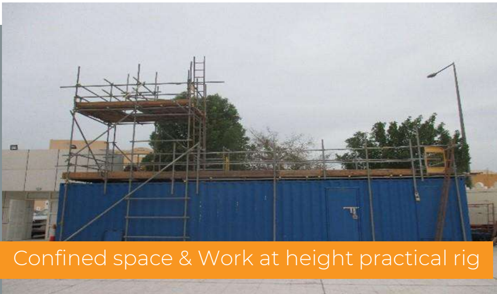
Confined space & Work at height practical rig