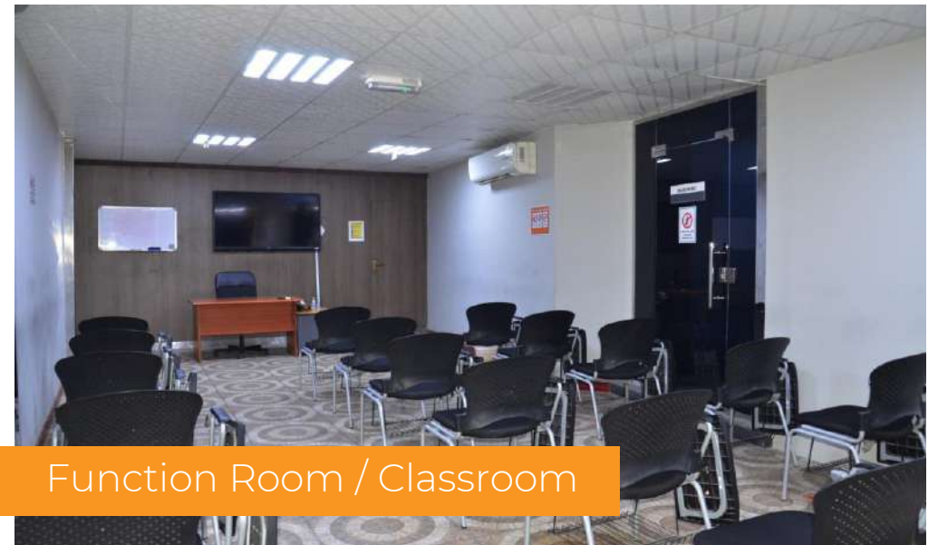
Function Room / Classroom