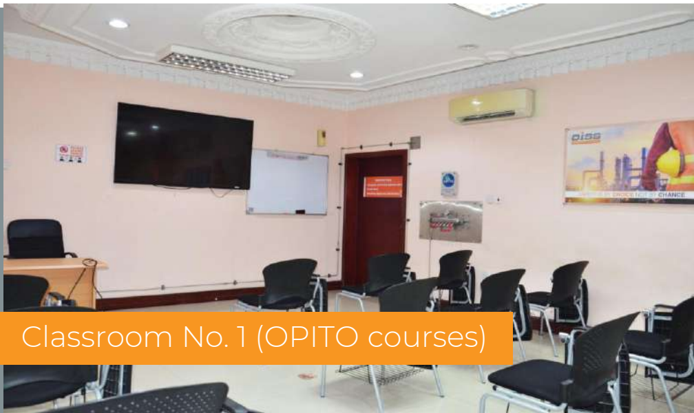
Classroom No.1 (OPITO courses)